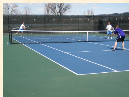
Action on Riverside courts

USTA-MT has the tournament schedule for the year at their web site. http://montanatenis.org/wp-content/uploads/2013/12/2014-Tournament-Schedule-Final.pdf