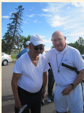
Some Winners at 2013 Senior Olympics