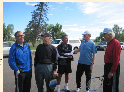
Senior Olympic Participants