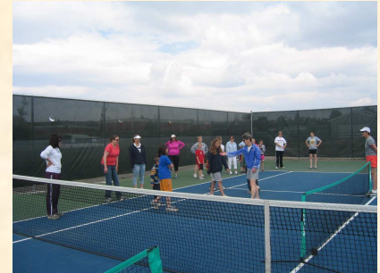
Mom and Me Event, 2012